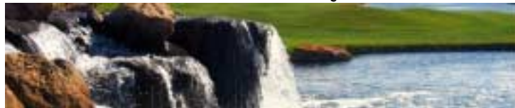
El Rio Country Club